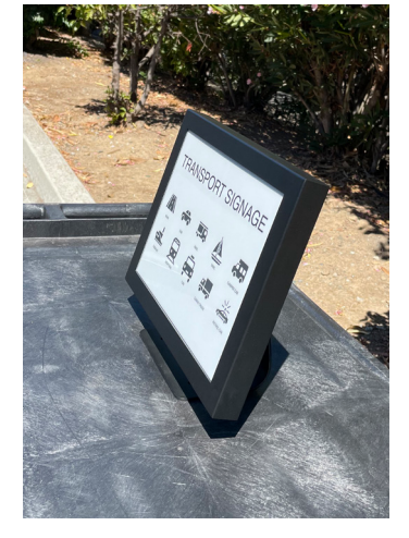
13.3" E Ink panel in an enclosure in direct sunlight