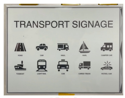
13.3" E Ink Panel