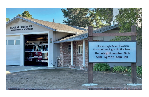
84" High Resolution Digital Public Signboard